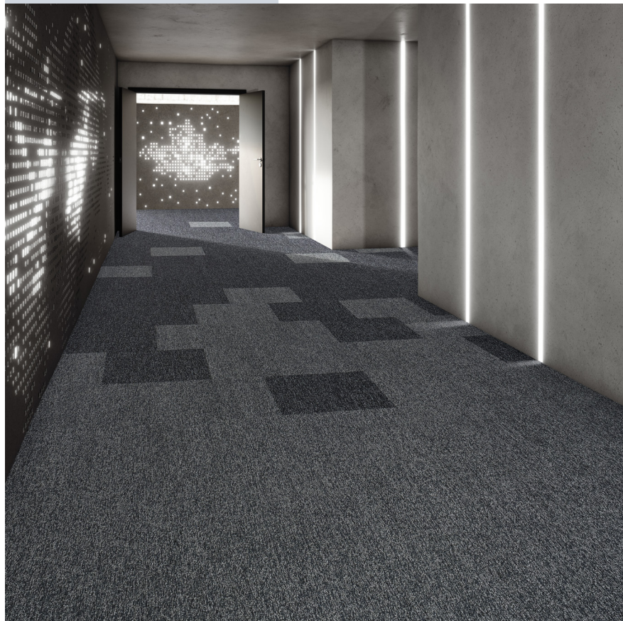
Blaze 553, 961