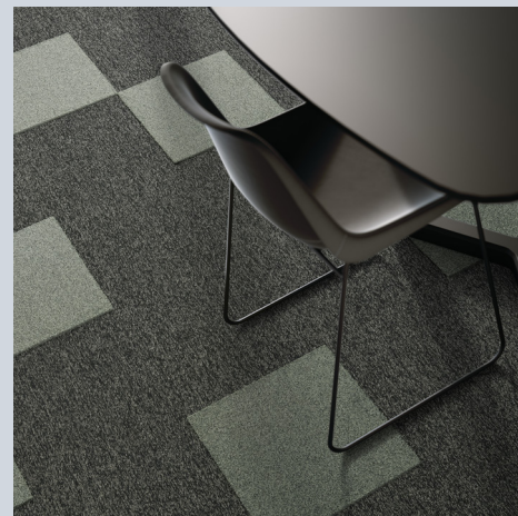
Blaze 668 & Gleam 615